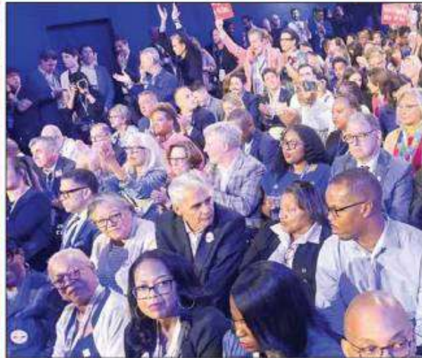
District of Columbia Democratic Party delegates at the 2024 Democratic National Convention in Chicago.

DMV AT THE DNC; LOCAL LEADERS, ADVOCATES, DELEGATES SPARK WOMEN'S