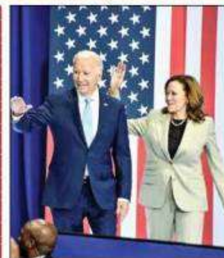
In their first joint public appearance since President Joe Biden ended his candidacy, he and Vice President Harris met a friendly crowd in Prince George's County, Maryland and spoke about their administration's efforts to lower prescription drug costs.