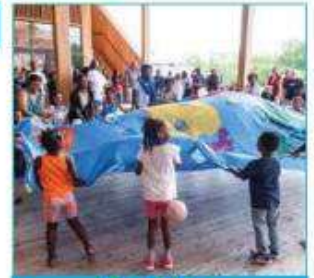
River Fall Fest Page 9